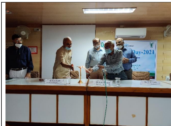
Inauguration by lightening the lamp